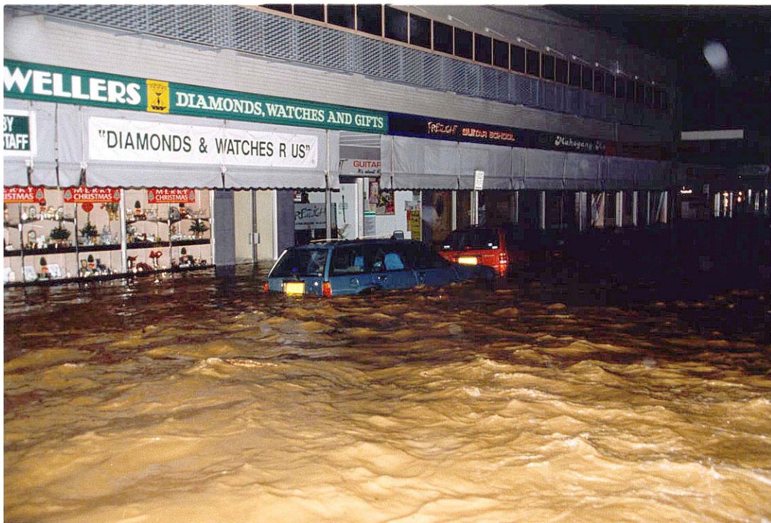
Photo 1 – Much of the commercial area of Coffs Harbour was affected by the 1996 flood

People were shocked and traumatised by the suddenness of the storm and flooding. Residents did not look on Coffs Harbour as being a “flood town”. Owners of affected properties often stated that given the fact that their floor levels were 0.5m above the 100 year flood (as Council requires) they assumed they were safe from flooding.